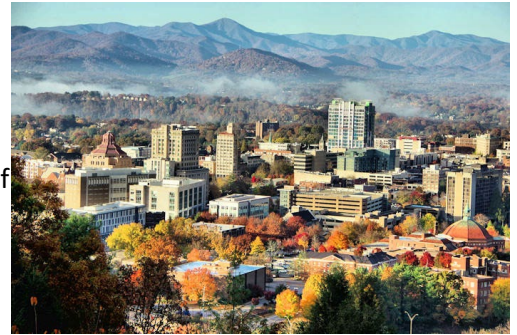
Asheville, North Carolina

What: This annual event will feature educational sessions, professional networking, vendor displays, group social events, a local plant visit, the annual NCALC membership meeting, and opportunities for everyone to have fellowship with other participants. In addition to the planned NCALC activities, participants may wish to plan to take advantage of some of the many year-round activities and attractions of the Asheville area. (See list of suggested activities on subsequent page.)