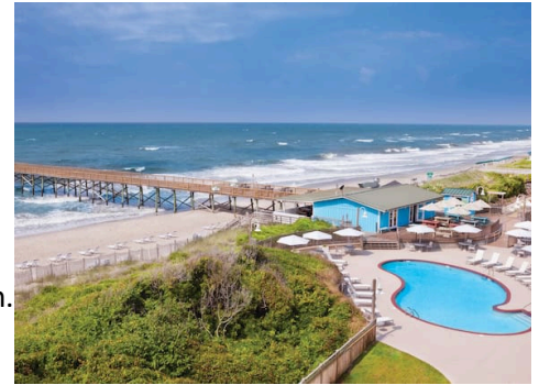
Atlantic Beach, North Carolina

What: This annual event will feature professional networking, educational sessions, vendor displays, group social events, the annual NCALC membership meeting, meetings of key committees, and opportunities for everyone to have fellowship with other participants. In addition to the planned NCALC activities, participants may wish to take advantage of some of the many year-round activities and attractions of Atlantic Beach and the surrounding area.